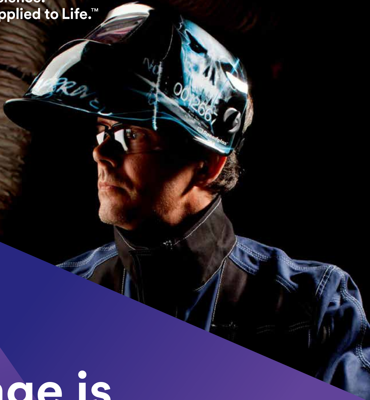
Image is Everything!

Legendary 3M™ Speedglas™ optical clarity, powerful performance and distinctive graphic designs.