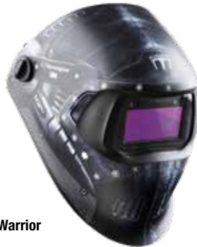
Trojan Warrior 751620