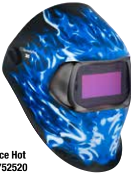
Ice Hot 752520